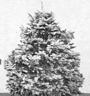
Black Hill Spruce

WESTERN MAINE FOREST NURSERY CO., FRYEBURG, MAINE